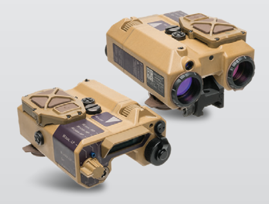
For additional information, <u>view the RAPTAR S product page</u> or <u>download the technical datasheet</u>. For general information about Wilcox and our products contact us directly or <u>download our Product Catalog</u>.

From the ground up the RAPTAR S was designed to be critically focused on reinforcing the elite warfighter's situational awareness and enhance his or her mission authority by extending the tactical edge.