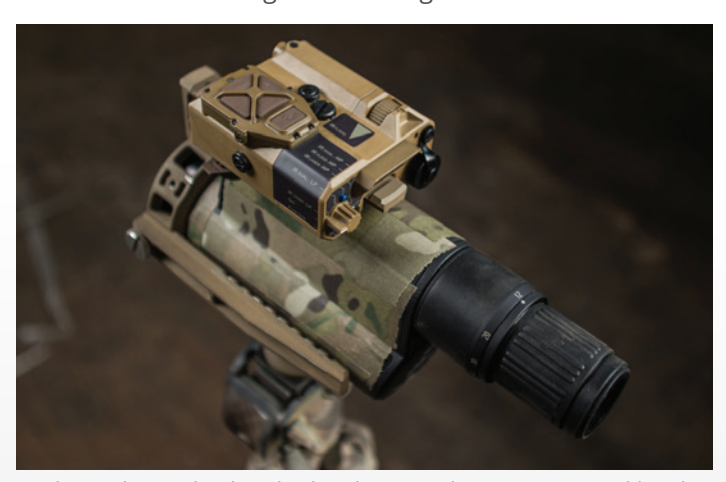
Working with Kestrel, Wilcox developed two-way data transmission adding the ability to load all data directly into the RAPTAR S or vice versa including the ability to stream windage.

down). This adjustment shows up on the system's display in either MILs or MOAs. All this happens in about a second after the shooter ranges to the target.