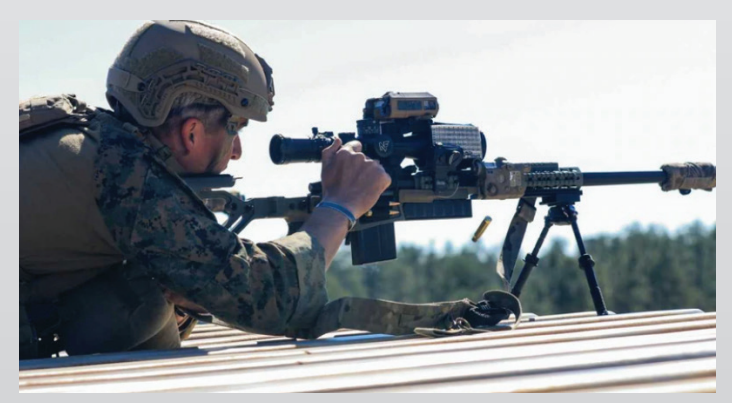
A shooter in the U.S. Army Special Operations Command International Sniper Competition takes aim during an event at Fort Bragg, North Carolina.

Every year, snipers test their skills in a series of events designed to push their tactical skills at the US Army Special Operations Command International Sniper Competition. The competitors work in small teams and compete in speed and accuracy in environments that are built around