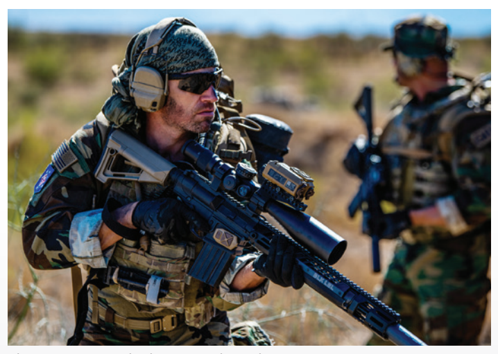
The RAPTAR S can also be mounted on other weapon systems giving a tremendous range advantage with fast, precise, lethal rounds on target.

realistic scenarios. Nowadays, shooters would not even show up without a fire control system. The sniper tables of the past, now just used as backup, are no match for these digital sniper assistants. How widely used and effective are these systems? For reference, in the last four years the RAPTAR S has consistently been selected as the sight of choice at the world renowned USASOC Sniper Competition. Teams using the RAPTAR S have won the top three positions several years in a row.